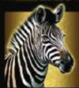
Of A Kind