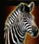
Of A Kind