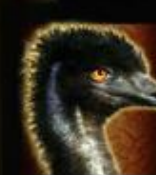
Of A Kind