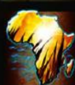
Of A Kind