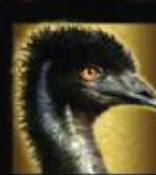
Of A Kind