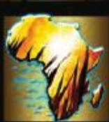
Of A Kind