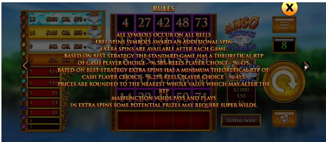
The prizes are paid in accordance with the payout table available on the game interface.