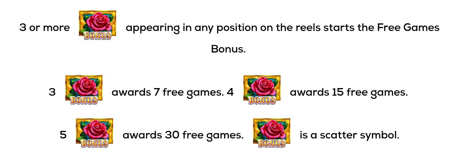
BONUS : PAY TABLES